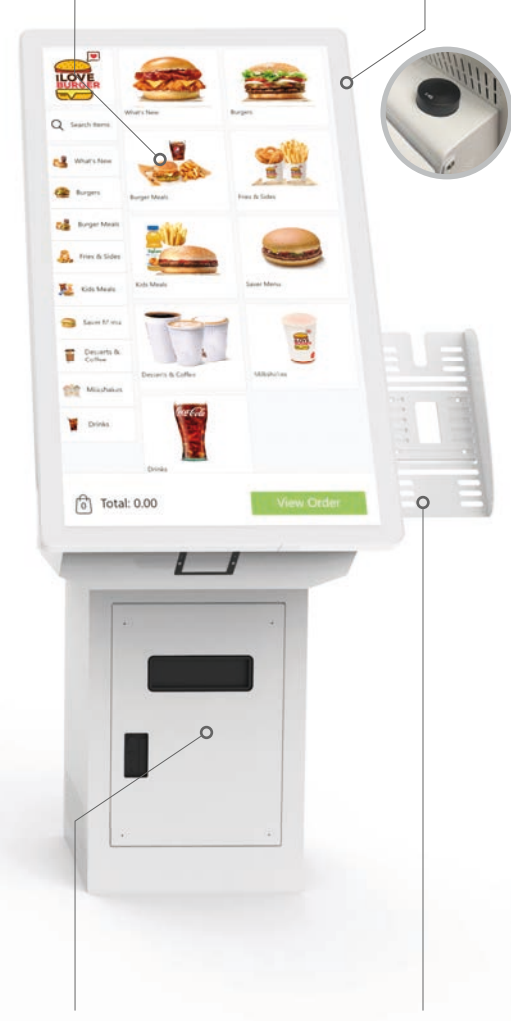
QUICK ACCESS PRINTER